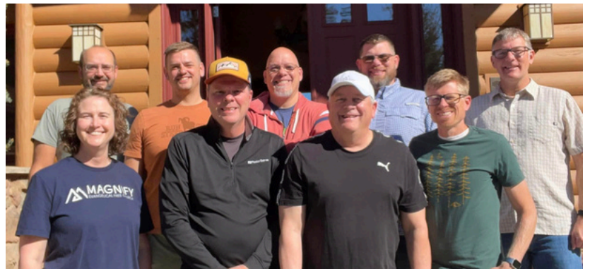
Our District Leadership Team retreated to the mountains for prayer, planning... and some corn hole.