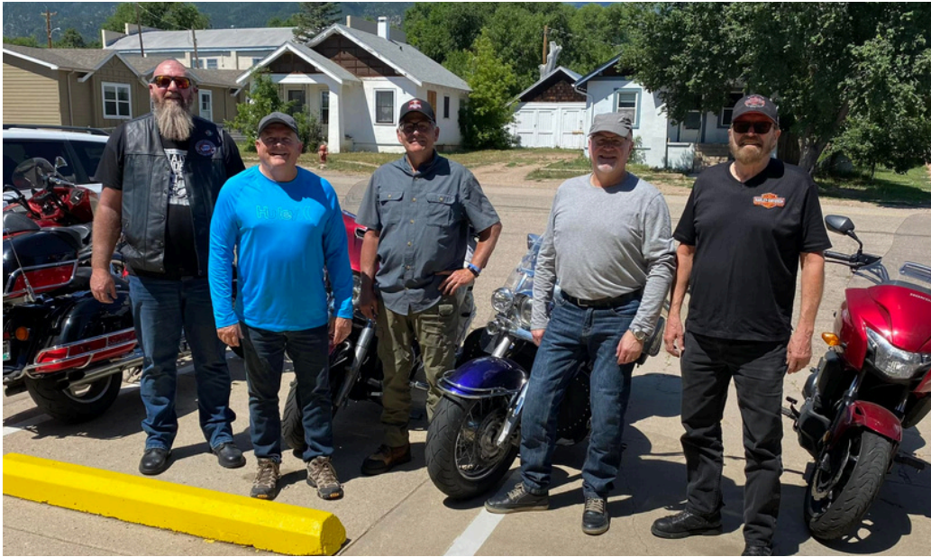
The RMD motorcycle gang visited churches on the western slopes and in southern Colorado! They enjoyed encouraging and praying with pastors.