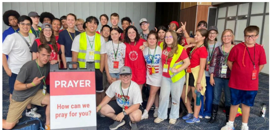
New Life Community Church (Aurora, CO) out praying for the people they meet around Kansas City while at the Challenge Conference.