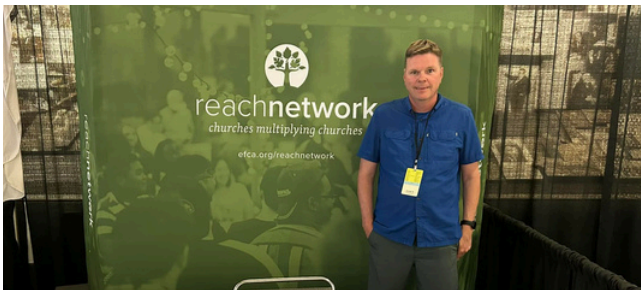
At our ReachNetwork booth at Challenge, our goal was to get at least 500 students to set a reminder on their phones for 10:02 based on Luke 10:02 to pray for workers for the harvest! Mission accomplished!