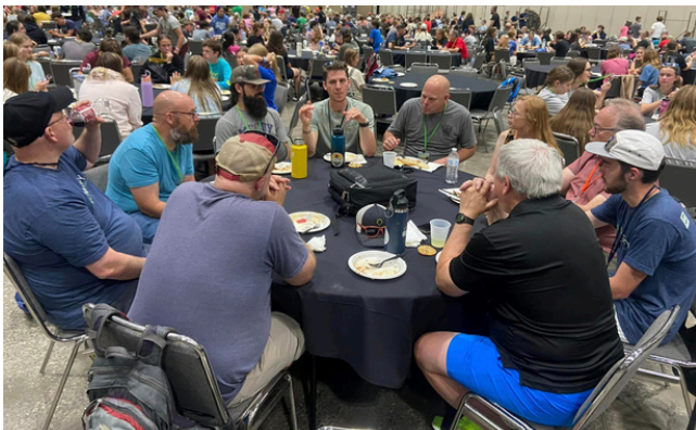
RMD youth leaders unite at Challenge