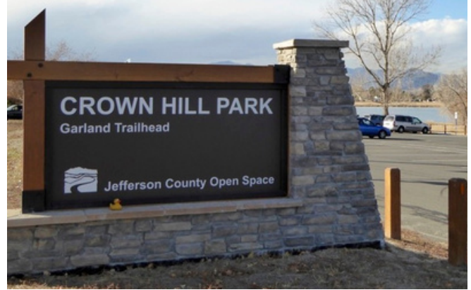
Planting in the Crown Hill Park Area of Wheat Ridge